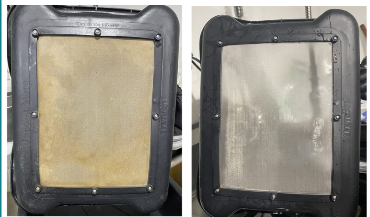
TRIMMING ROOM BEFORE AND AFTER EXAMPLE PHOTOS