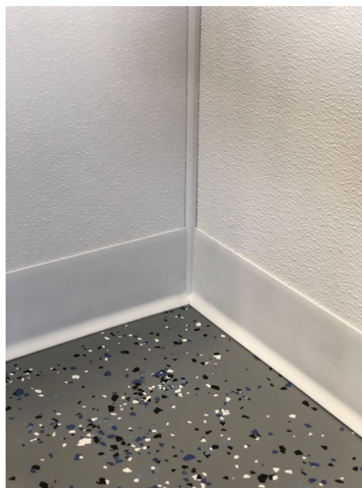
DRYING ROOM BEFORE AND AFTER EXAMPLE PHOTOS