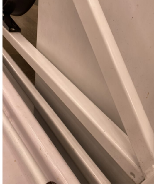
PLANT ROOM BEFORE AND AFTER EXAMPLE PHOTOS