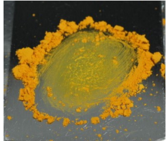
SOIL LOAD REPLICATED